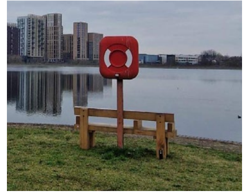
*New bench on No.4

Thames Water are to clarify some of the fishery rules and hopefully some notices will appear in the lodge soon. We should all still try to sign in/out and record accurate catch returns, this does help.