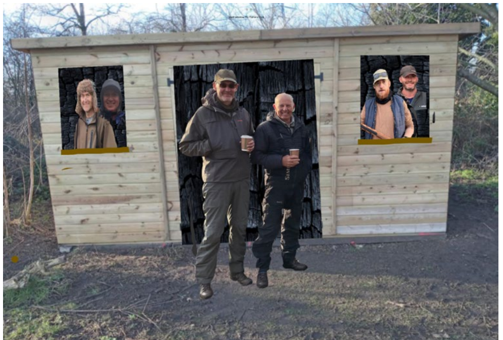
*The committee enjoying the new shed

Look forward to seeing you all on the banks, tight lines