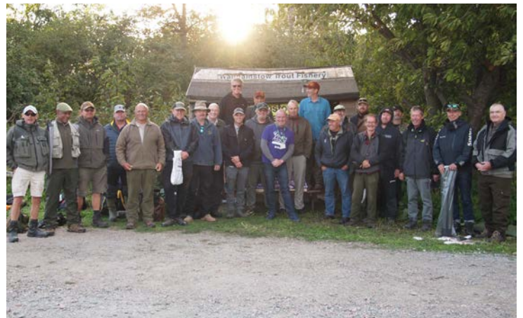
*All competitors after the weigh in.