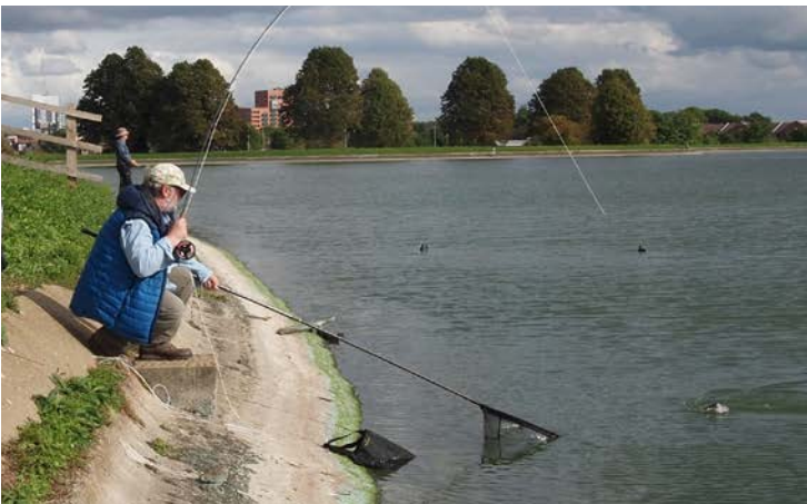
*Plenty of fish coming to blobs on the causeway.