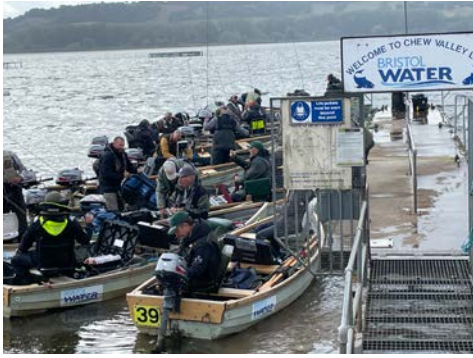
*Getting ready for the start.